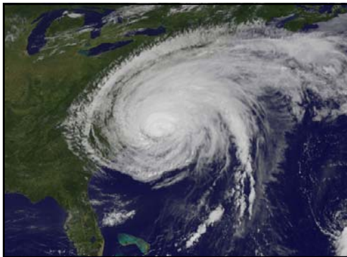
Satellite image of Hurricane Irene on August 27, 2011 at 10:10 a.m. EDT after it made landfall at 8 a.m. in Cape Lookout, North Carolina.